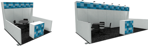
10' x 10' Shell Scheme 10' x 20' Shell Scheme

To view the official cancellation policy for exhibitors at XPONENTIAL 2027, please review the XPONENTIAL Exhibitor Terms and Conditions .