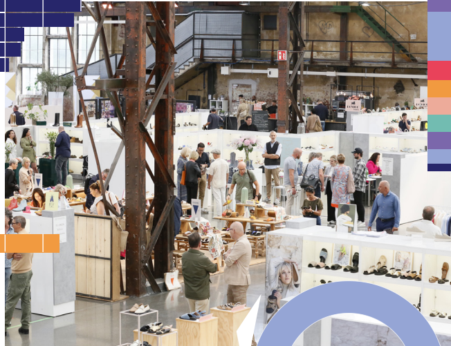
Herkunftsländer Country of origin