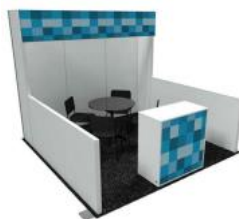
10' x 10' Shell Scheme