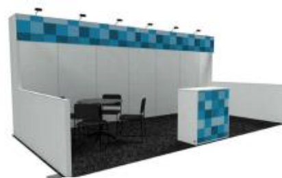
10' x 20' Shell Scheme