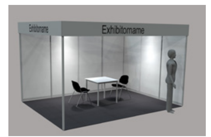
The fascia and furniture can deviate from the appearance of the graphic representation.

31 March 2023 Website: www.wire-eurasia.com www.tube-eurasia.com