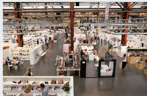
Example; construction maybe different depending on the segment

In order to preserve the individual look of your stand, we ask that you include the stand number in your stand planning. The stand construction must be approved by the organizer. The transmission of the complete technical documentation is a prerequisite for the approval of the stand construction.