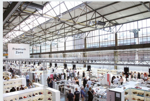
Example; construction maybe different depending on the segment