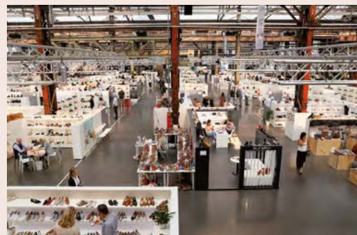
Example; construction maybe different depending on the segment

The stand construction must be approved by the organizer. The transmission of the complete technical documentation is a prerequisite for the approval of the stand construction.