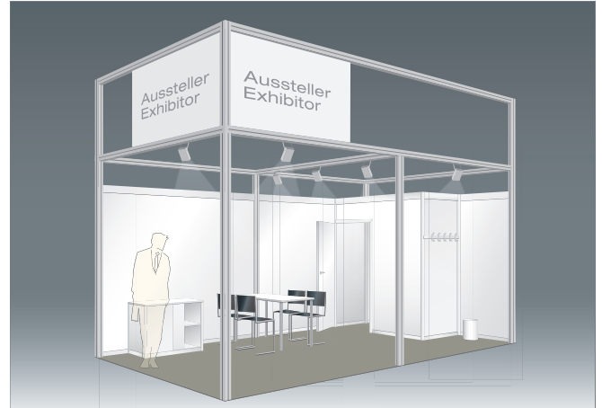
D2 Premium Package, 440.– €/m 2