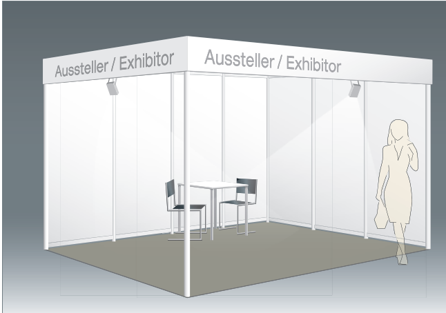
D1 Basic Package, 380.– €/m 2