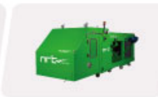
NATIONAL RECOVERY TECHNOLOGIES (NRT)

Plastic optical sorting machine for polymer and color