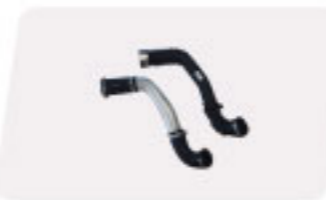
DUPONT PERFORMANCE MATERIALS

The global trend of pursuing a circular, low-carbon economy, combined with demand for ever-increasing product sophistication, is driving the need for high-tech materials. At CHINAPLAS 2017, more than 1,000 suppliers will showcase their latest offerings in this area, including advanced composites and high-performance engineering plastics. Be sure to check out the show's "Chemicals & Raw Materials Zone", "Composite & High Performance Materials Zone" and "Bioplastics Zone".