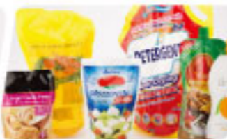
DOW CHEMICAL PACIFIC (SINGAPORE) PTE LTD

Zytel® Resin Improve Its Ability To Absorb NVH