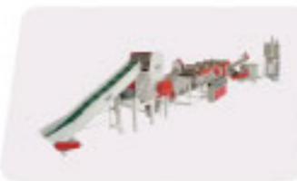
JIANGSU FANGSHENG MACHINERY CO., LTD.

Conserving resources and adopting eco-friendly materials and technologies are keys for business sustainability. To align with this trend, CHINAPLAS 2017 will display a wide array of green solutions applicable to different manufacturing industries, while also featuring a dedicated "Recycling Technology Zone".