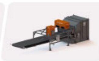
TOMRA SORTING TECHNOLOGY (XIAMEN) CO., LTD

Plastic optical sorting machine for polymer and color