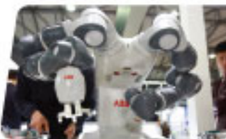
ABB ENGINEERING (SHANGHAI) LTD.

To remain competitive, manufacturers constantly strive to upgrade their production technologies and product quality, and "smart manufacturing" is one of the key strategies being adopted to enable such continuous improvement. By adding an "Automation Technology Zone" to its well-established "Machinery Zones", CHINAPLAS 2017 will present the latest intelligent manufacturing technologies to the plastics, rubber and end-user industries.