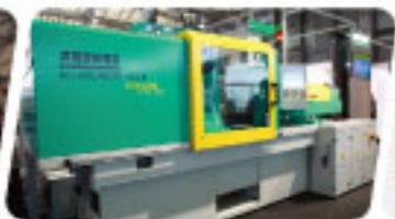
ARBURG (SHANGHAI) CO., LTD.