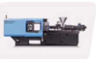
DEMAG PLASTICS MACHINERY (NINGBO) CO., LTD.